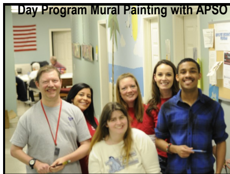
Day Program Mural Painting with APSO

Call us with questions about our programs of service at any time, Monday through Friday from 8:00-4:30 CST. We want to help.